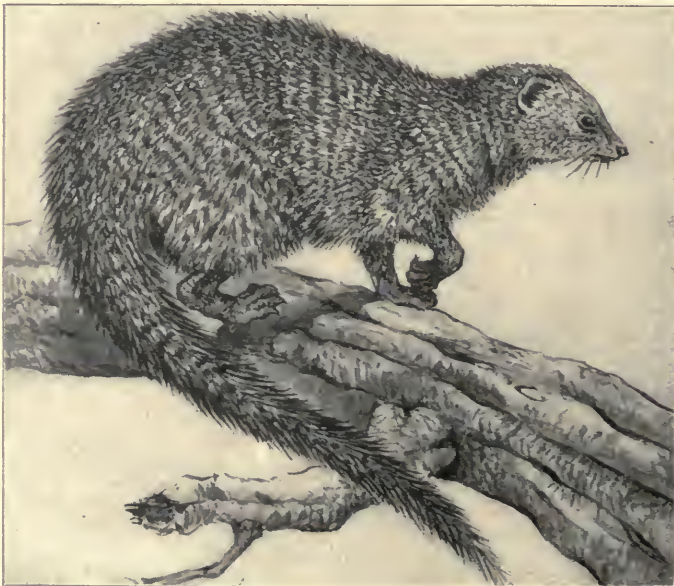
FIG. XLIV. MUNGOS MUNGO. MUNGOOSE.